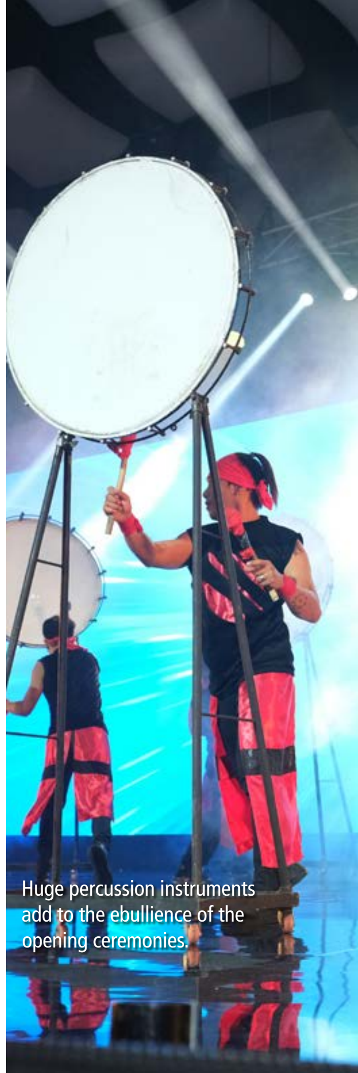
Huge percussion instruments add to the ebullience of the opening ceremonies.

It was the opening of the 2019 Manila Rotary Institute (MARI) and at four in the afternoon of November 29, the Rotarians, donned in their national costumes, entered the Marriott Grand Ballroom.